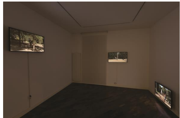
"Una sola moltitudine" at smART – polo per l'arte, Rome, 2016